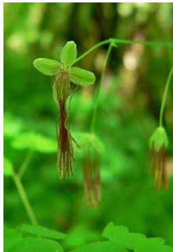
Thalictrum occidentale from http://www.nwnature.net/index.html

Our local version of the genus Thalictrum is represented by Western Meadowrue, Thalictrum occidentale , a member of the ranunculaceae or buttercup family. Distributed throughout the temperate zone, Thalictrum species are herbaceous perennials with impressive floral diversity, including four breeding systems and two pollination mechanisms making them ideal subjects for the study of evolution. While the genus lacks petals, petal like features occur as a result of organ elaboration in sepals and stamens, resulting in marked differences between inconspicuous green wind pollinated and showy purple flowers in insect pollinated species. Another trend in the evolution of Thalictrum floral development is the modification of organ identity genes resulting in flowers that are unisexual from inception in several species. This talk is your chance to learn about the origins of the fascinating diversity of form we see in plants in the field from one of the leading researchers in this field. Veronica is a native of Argentina and an assistant professor of Biology at the University of Washington.