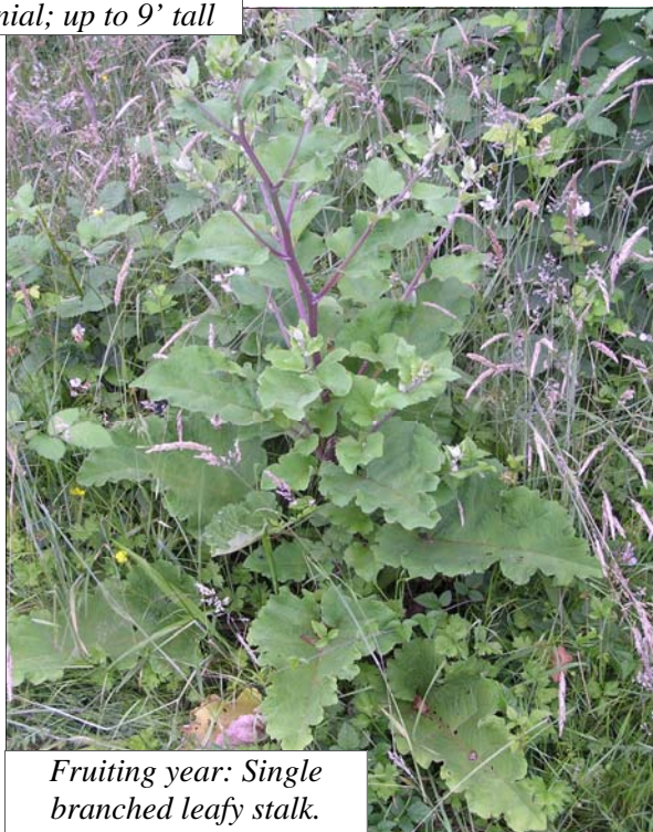
Fruiting year: Single branched leafy stalk.