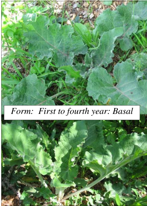
Form: First to fourth year: Basal

General: Deciduous to evergreen biennial; up to 9' tall