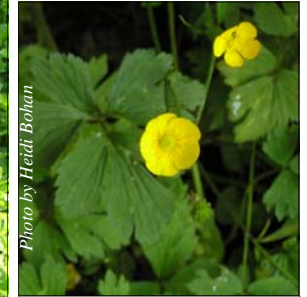
Flower: Yellow, shiny buttercup flower