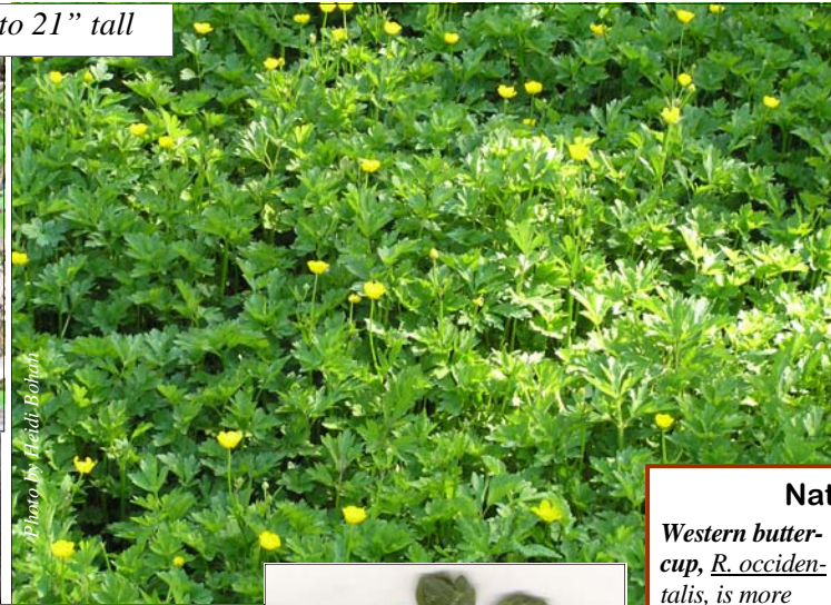
Form: Spreading basal clump which forms masses