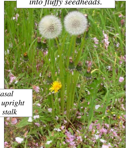
Form: Basal rosette with upright flowering stalk