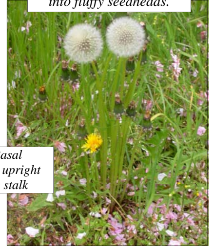
Form: Basal rosette with upright flowering stalk