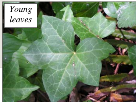
Form: Spreading and climbing vines