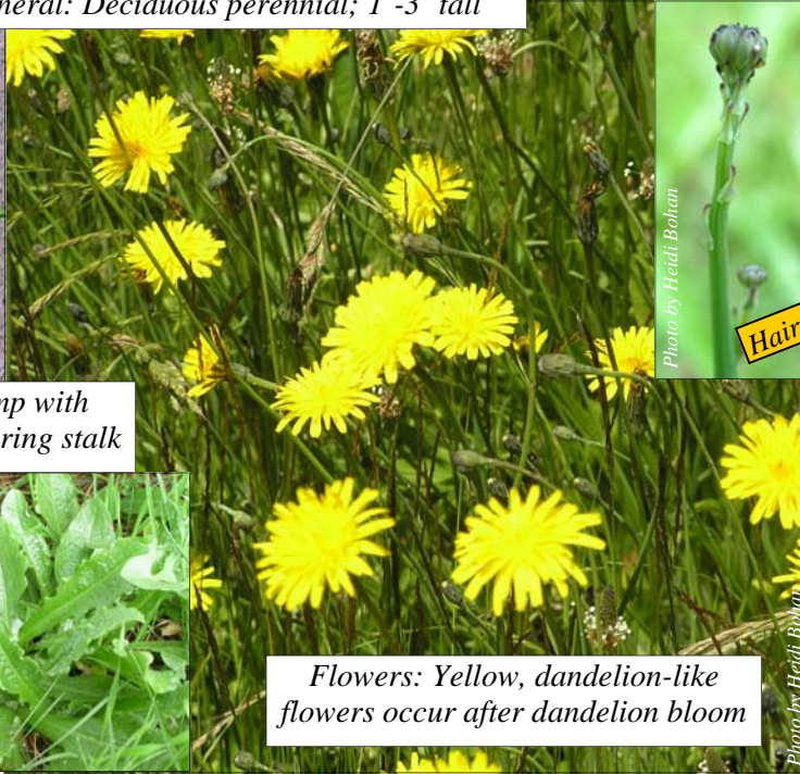
Flowers: Yellow, dandelion-like flowers occur after dandelion bloom