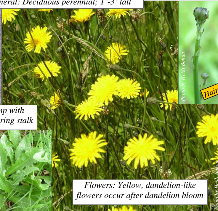
Flowers: Yellow, dandelion-like flowers occur after dandelion bloom