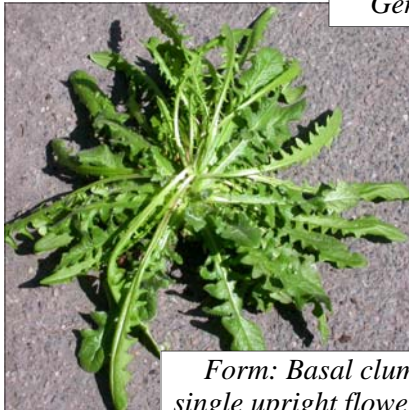
Form: Basal clump with single upright flowering stalk

General: Deciduous perennial; 1'-3' tall