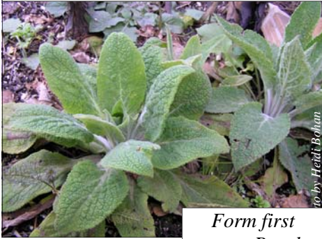
Form first year: Basal

General: Biennial or short-lived perennial; up to 7' tall