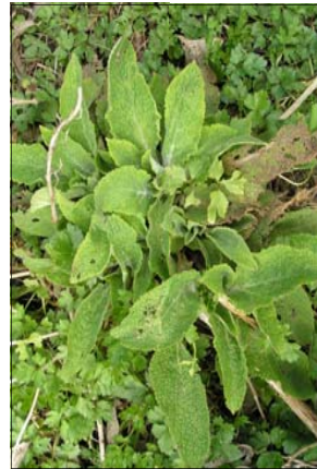
Form second year: Basal clump with leafy stalk