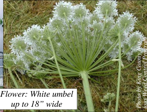
Flower: White umbel up to 18" wide

Caution: Stems and leaves are phytotoxic which can cause skin blisters upon contact followed by exposure to the sun.