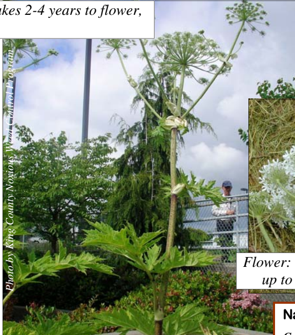
Mature form: Single leafy stalk that reaches 8-15' tall.