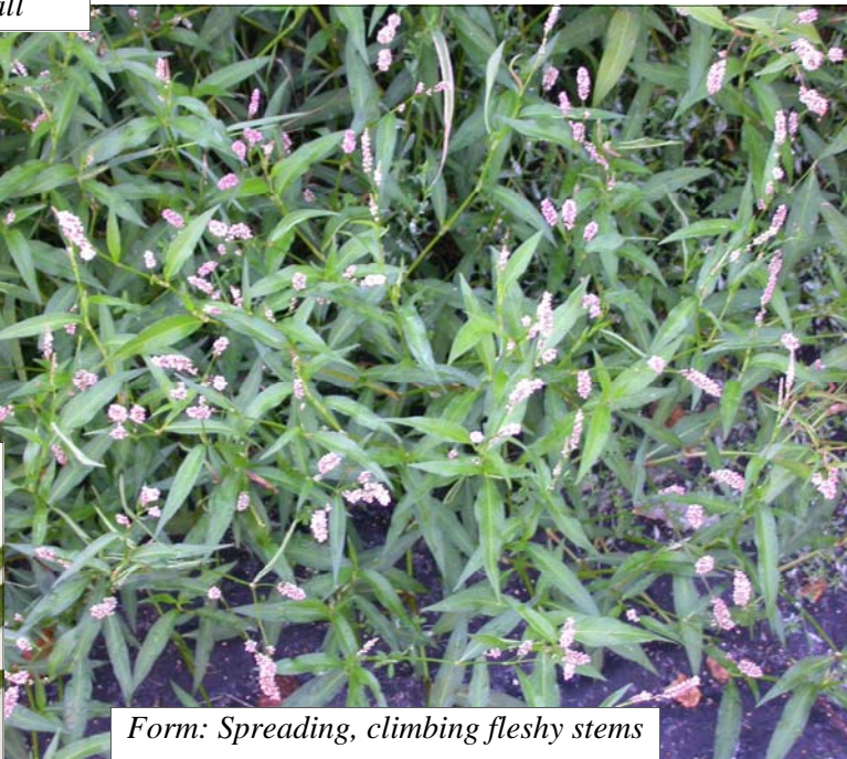
Form: Spreading, climbing fleshy stems