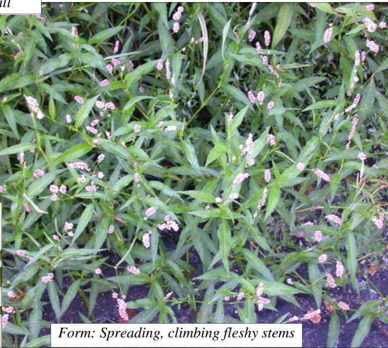
Form: Spreading, climbing fleshy stems