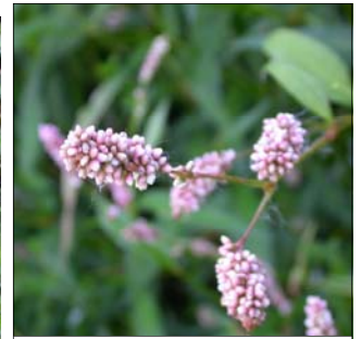
Flowers: Pink clusters