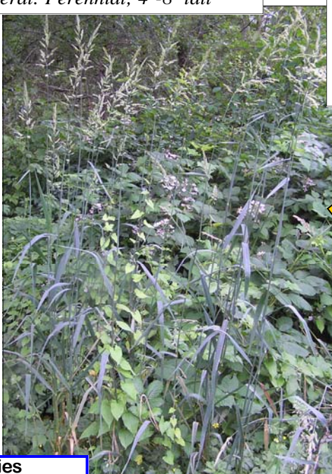
Form: Clumping, upright and spreading