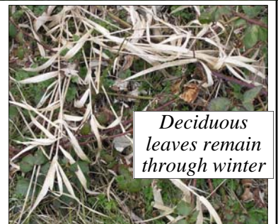
Deciduous leaves remain through winter