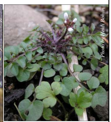
Form: Basal clump with erect stalks.