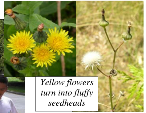
Yellow flowers turn into fluffy seedheads