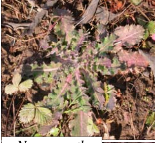
New growth forms rosettes

General: Annual to perennial species; 4'-8' tall