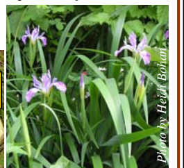
Iris tenax (Oregon iris)