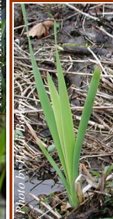
Typha latifolia (Cattail)

Cattail, Typha latifolia , has similar new growth in spring but leaves are arranged in rounded layers rather than flat. Iris tenax and I. douglasii have similar, but much thinner, leaves 12"-24" long, and purple-blue flowers.