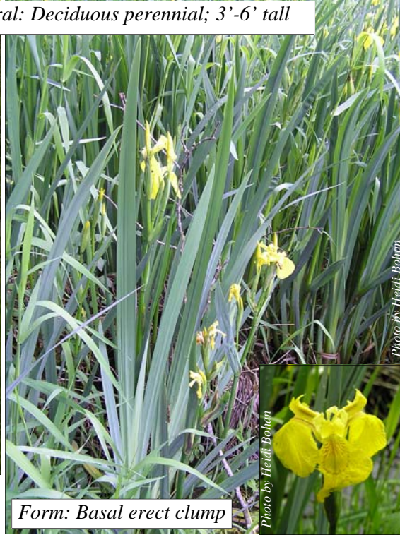
Form: Basal erect clump