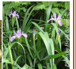
Iris tenax (Oregon iris)